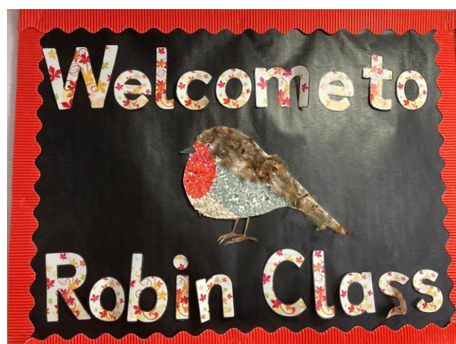
School Display – by Year 1

The staff have looked carefully at where children are 'behind' in their learning and have adapted and rewritten schemes of learning to ensure that these areas are covered next year and in subsequent years.